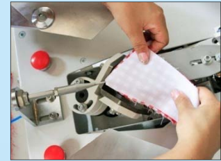
切領咀、反領操作 Collar tip trimming and turning