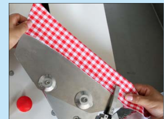
機械夾夾緊領 Automatic clamp for clamping collar tightly